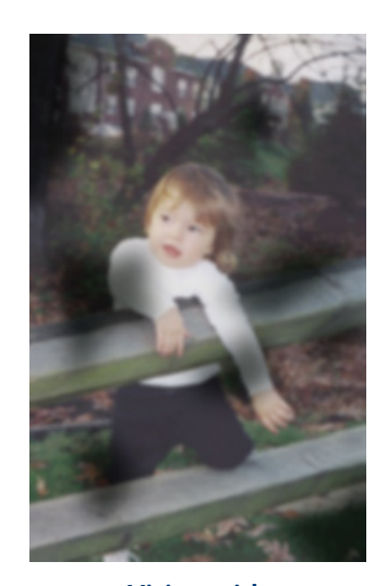
Vision with Diabetic Retinopathy